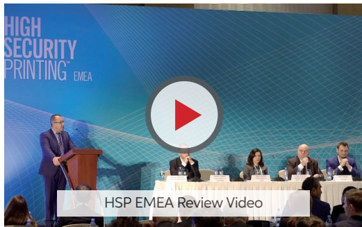
HSP EMEA Review Video

We believe it was a very positive experience in which besides having participated with a stand we attended highly interesting conferences.