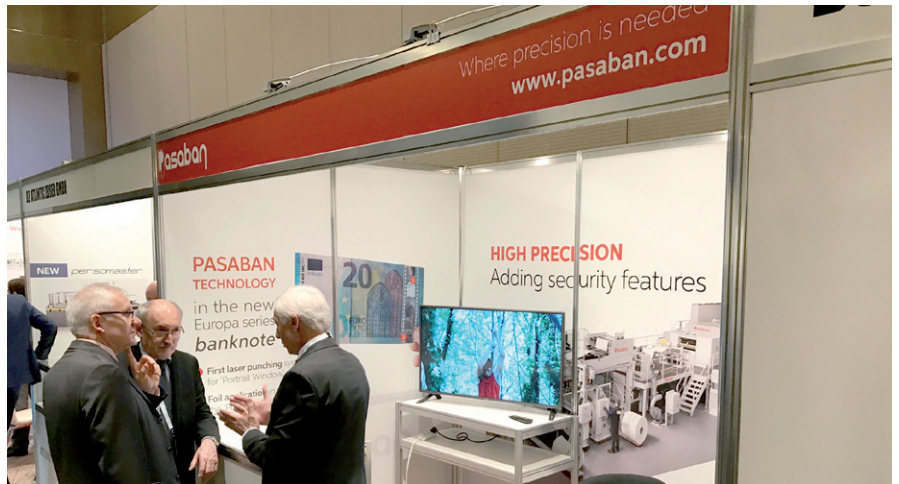
Pasaban booth at HSP Europe

As for highlights we choose the conferences of Turkey, Poland and Hungary, countries which agreed that the amount of cash in circulation has increased substantially in the last 10 years. Conferences presented by companies such as Innovia, Kba-Notasys, Sicpa, Kurz and G&D were also relevant, as was the case study of “Chess house note”, developed by PWPW, Sicpa and Jura, which demonstrated elements of latest-generation security.